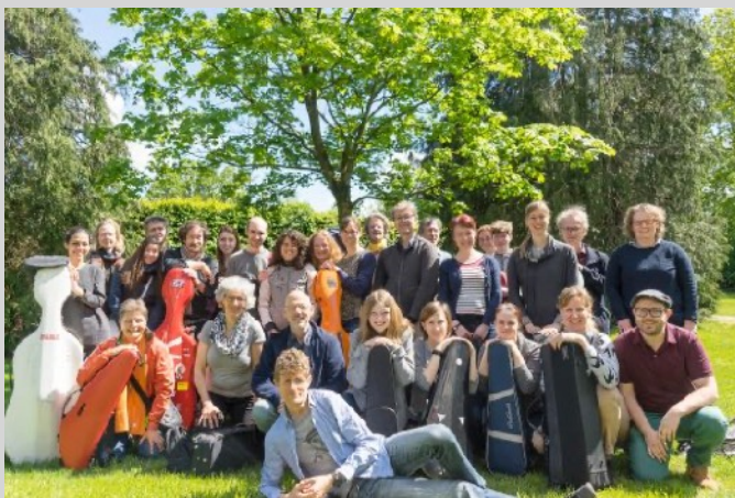
Academy of Improvising Strings 2020 with Tim Kliphuis and North Sea String Quartet (NL)