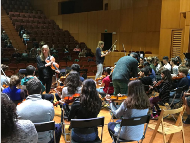
Creative string playing workshop at Conservatory of Las Palmas de Gran Canaria