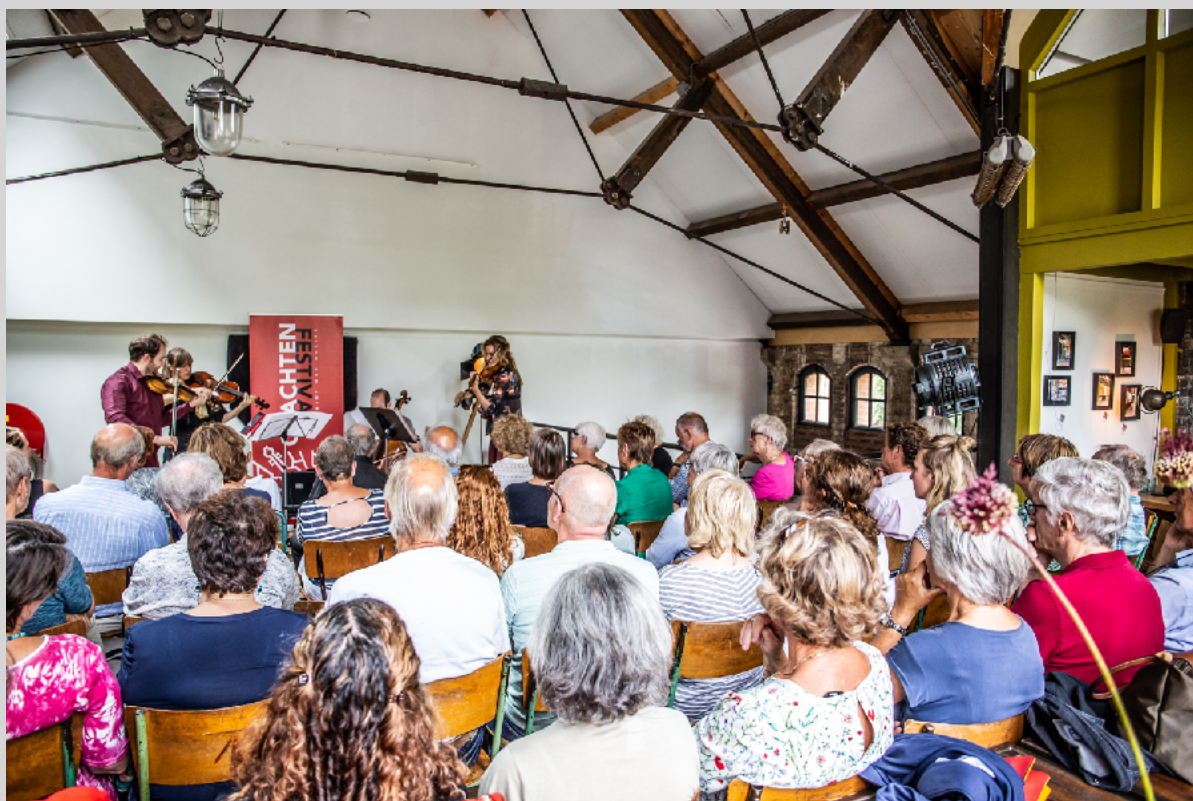
At GrachtenFestival (Amsterdam)